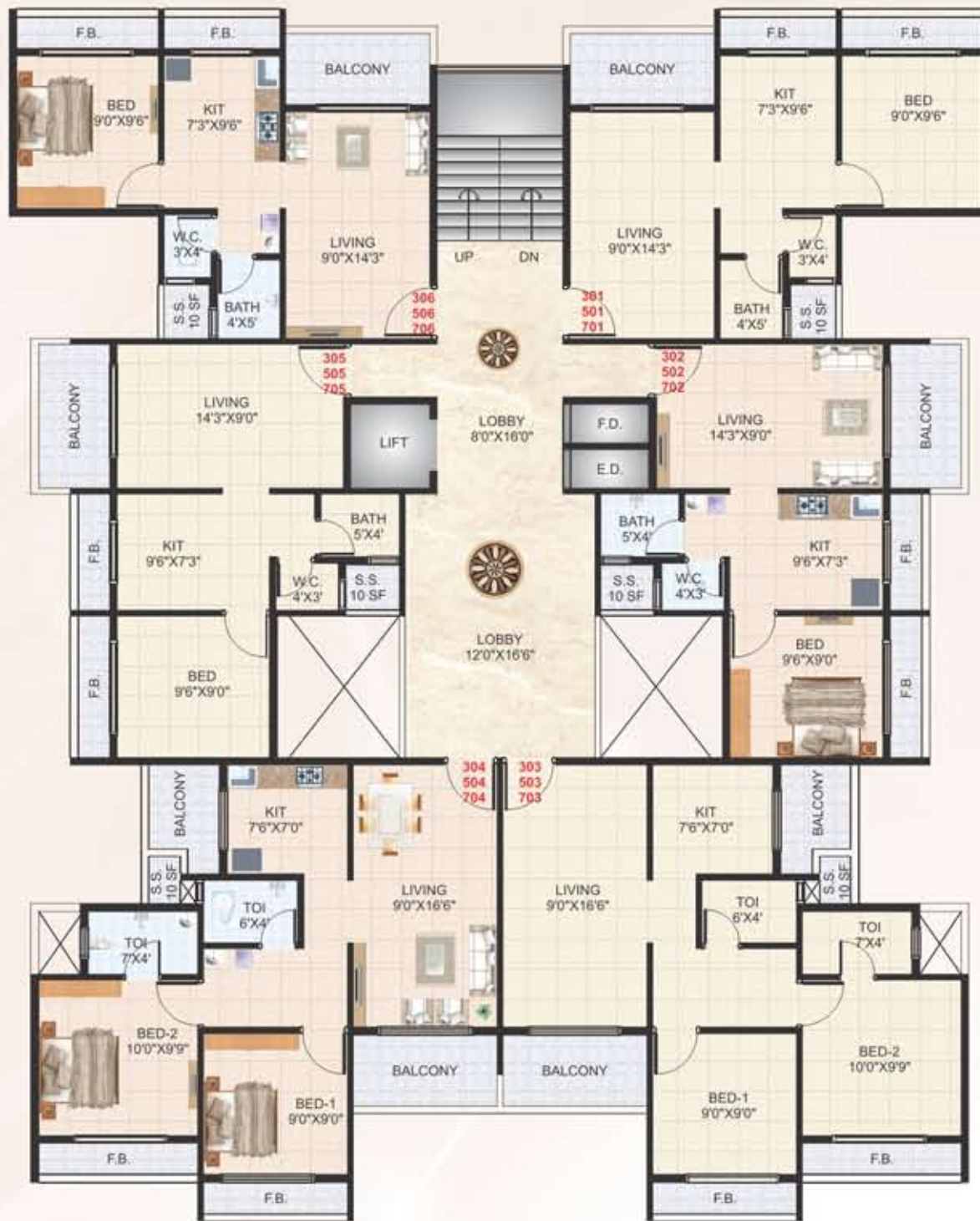
TYPICAL FLOOR PLAN (3RD, 5TH, 7TH)