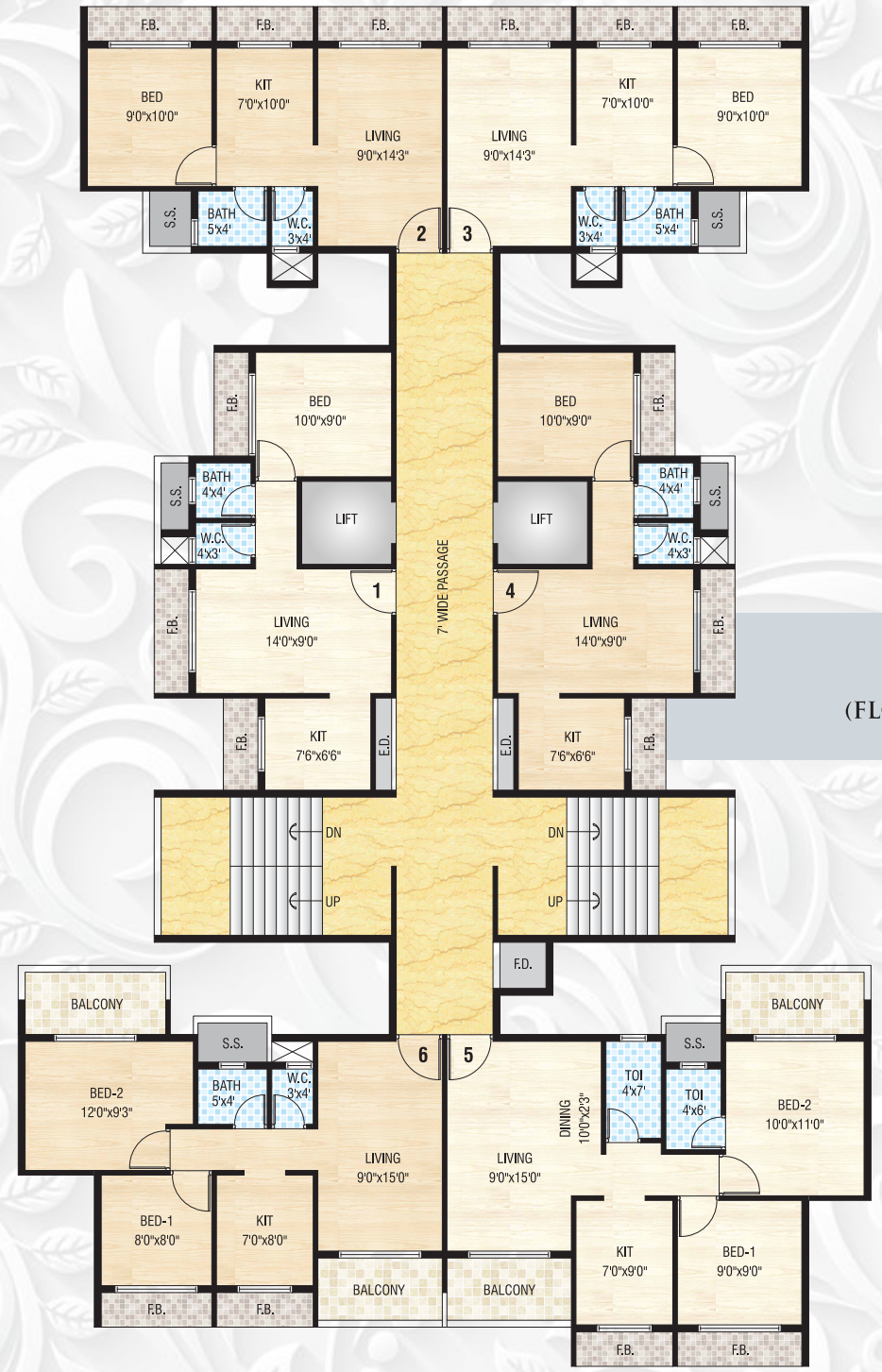
TYPICAL FLOOR PLAN (FLOOR PLAN MAY VARY ON DIFFERENT FLOORS)